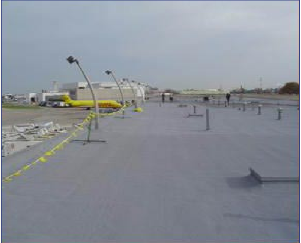
This 45,000 sq. ft. roof was completed in just seven days.

For more information call: Jack Moore 800-356-5748 x102 jackm@westroofingsystems.com Job #23151